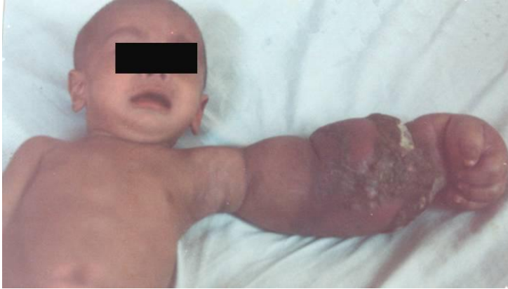
Fig 4: Rapidly growing KHE

be effective in steroid-resistant cases. No single therapy has been shown to result in reproducible shrinkage of the tumor and reversal of KMP 85 . Corticosteroid therapy followed by vincristine has also been reported 76 . Surgical resection is sometimes possible in rare instances where the tumor is very small.