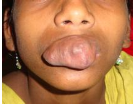
Fig. 9: Arteriovenous Malformations on the lip [Stage – II]

early childhood. Cerebrovascular hemorrhage is usually the main clinical presentation in more than 70% pediatric AVM patients resulting in high morbidity and mortality. AVMs within the brain tissue are usually diagnosed in adults 122, 123 .