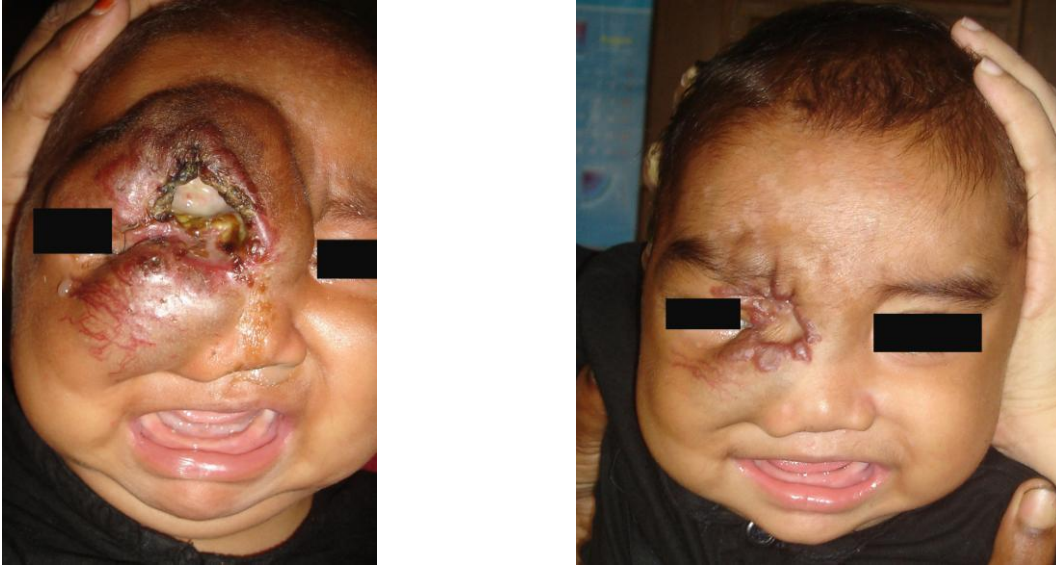
Fig. 3 : Before and after systemic steroid ( Oral Prednisolone)

Result of oral prednisolone therapy: A prospective case study of 55 hemangioma patients were carried out. Of 55 cases, 20 were in proliferating phase, 17 were in the early involuting phase and 18 were in the late involuting phase. All the patients were treated with oral prednisolone (3mg/kg/day as a single morning dose). In 2 patients, after initial regression of 2-4 weeks, there was no further regression. All other 53 patients demonstrated excellent response irrespective of the phases of the lesions, patients' age and sex ( Fig. 3 ).