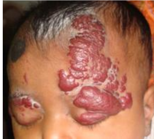
b. Multiple lesion