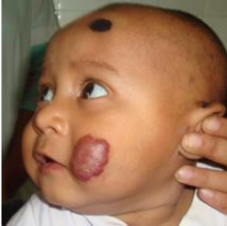
a. Single lesion