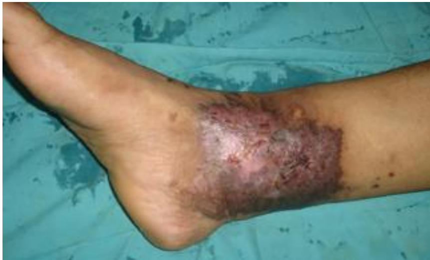
Fig. 10: Untreated case of AVM with pseudokaposiform changes [Stage – III]

Pulsed Doppler USG and MRI are diagnostic. Super selective angiography is unnecessary until intervention is considered. CT scan and MRI are the best available tools to detect AVMs in brain or other parts of the nervous system. A recently developed MRI-based technique called magnetic resonance angiography (MRA) can record both the pattern and velocity of blood flow through vascular lesions and the flow of cerebrospinal fluid (CSF) throughout the brain and spinal cord. MRA provides excellent 3-dimensional representations of the AVMs and their impact on the surrounding neurological tissues.